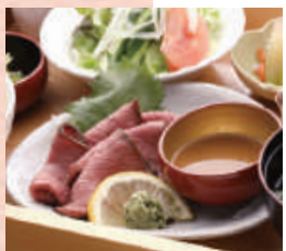
Roast Beef with Sansho Paste

Michi no Eki Yoka 241-1 Yoka-cho Takayanagi, Yabu City