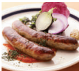
Homemade Sansho Sausage

Cafe de Manma 259-1 Yoka-cho Takayanagi, Yabu City