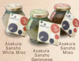
Asakura Sansho White Miso