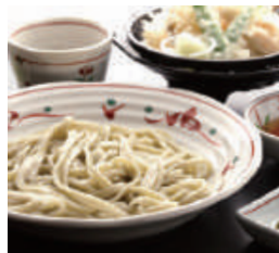
Sansho Tempura Udon

Tanigaki 1645-1 Yoka-cho Yoka, Yabu City