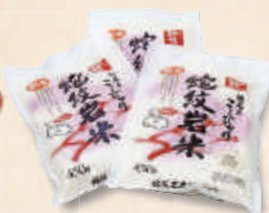
Jamongan Mai Rice