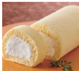
Sansho Roll Cake

Michi no Eki Yoka 241-1 Yoka-cho Takayanagi, Yabu City