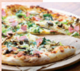
Sansho Miso Pizza

With a history of over 400 years, Asakura Sansho is a Japanese pepper from Yabu that was enjoyed by the legendary feudal lords, Ieyasu Tokugawa and Hideyoshi Toyotomi. It has fresh citrusy notes and is known for its high limonene and polyphenol content when compared to other sansho . It can be enjoyed at a wide range of restaurants in Yabu and in sweets including soft serve and roll cake as well as a variety of gifts including miso, tapenade and soy sauce.