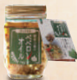
Asakura Sansho Peperoncino Oil