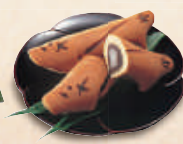
Ayu no Sasayaki